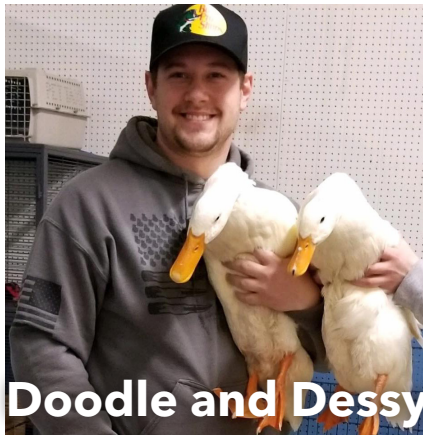
Doodle and Dessy